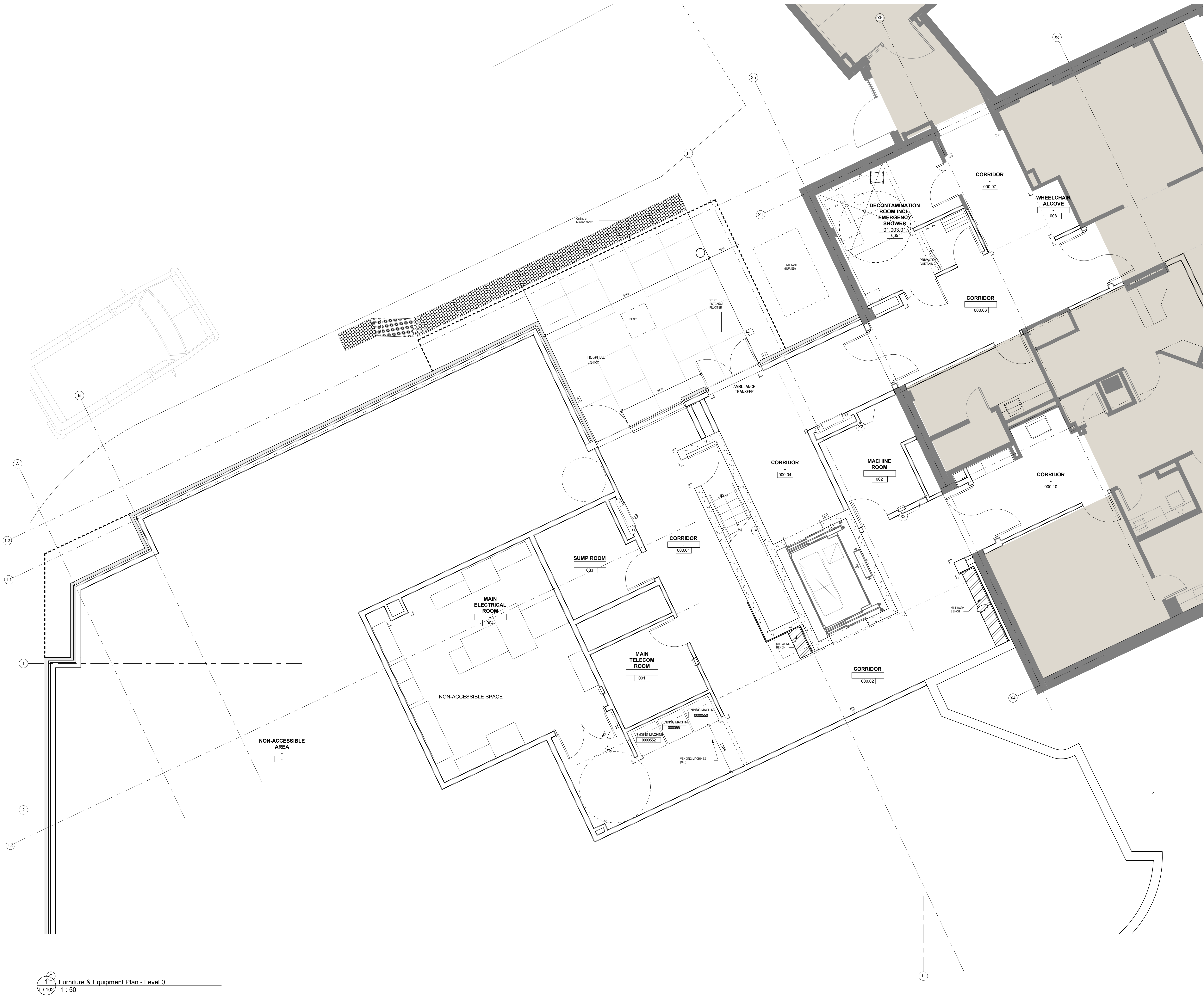
1 Furniture & Equipment Plan - Level 0 1 : 50